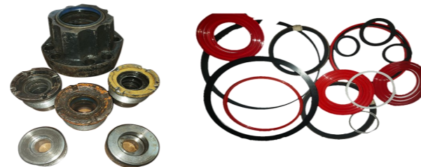
CUSTOM MADE SEALS