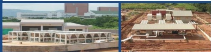
COURT OF APPEAL HQ AND ABUJA DIVISION, ABUJA

We can offer comments/advice on how your building can affect the type of air conditioning system proposed.