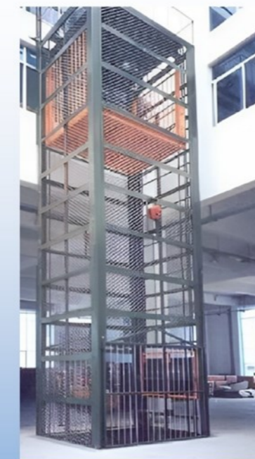
Goods Lift Cage Type

Quarrying Equipment (Complete system), Conveyer system, Feeder, Vibrating screens, Complete Quarry installation undertaken, Block making machine, Concrete mixers, Saw milling, Hoist machine, Stone planning machine Precasting moulds, Quarry Aggregate washing plant, All types of gear cutting, Industrial spares and parts.