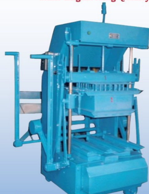
Palet type Block Making Machine