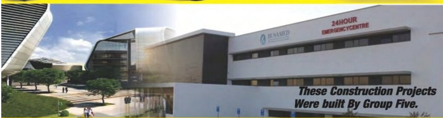
These Construction Projects Were built By Group Five.