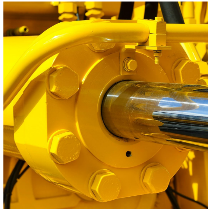
SERVICING HYDRAULIC CYLINDERS

In the dynamic landscape of East Africa's industrial sector, Oil Seals & Bearings Centre Ltd stands as a beacon of reliability, integrity, and unparalleled service – a testament to its enduring commitment to excellence.