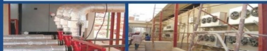
PRIMARY PUMP INSTALLATION AT NIGERIA JUDICIAL COUNCIL