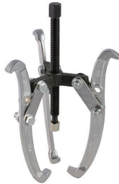
MAINTENANCE PRODUCTS & LUBRICATION