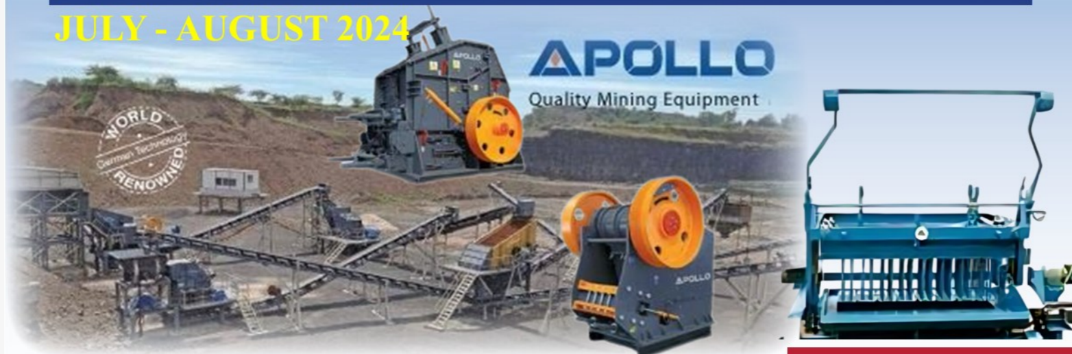
Lay type Block Making Machine

Unlock Engineering Excellence with Gahir Engineering Works Ltd, Kenya's leading firm for top-notch equipment. Authorized APOLLO Quality Mining Equipment dealers.