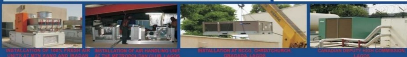
INSTALLATION OF 100% FRESH AIR UNITS AT MTA KANO AND IZADAN